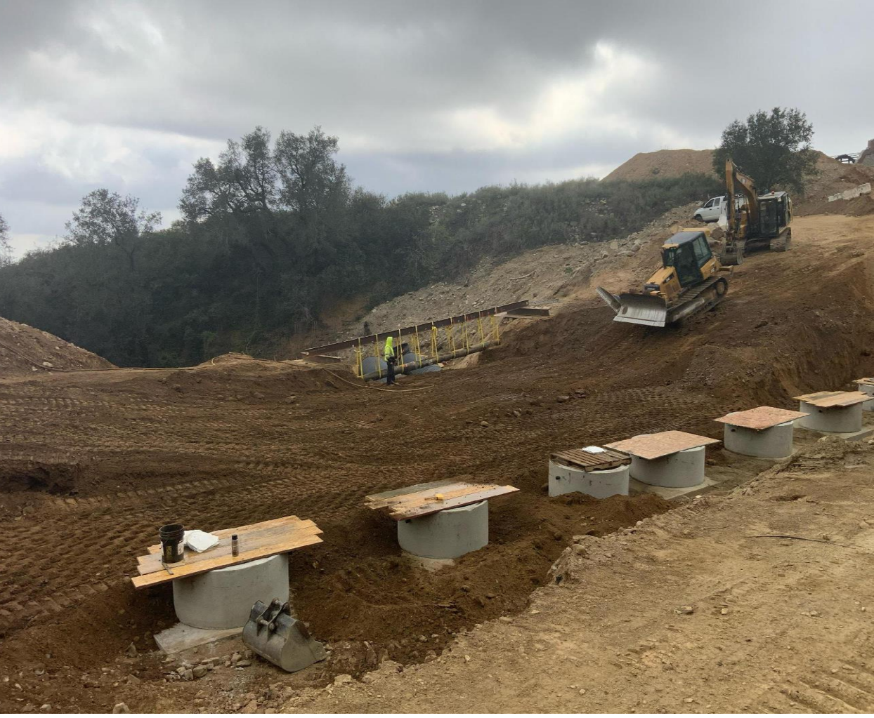
Christmas Canyon Work