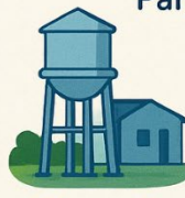
Water & Sanitation