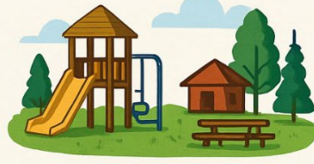
Parks & Rec