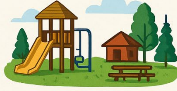
Parks & Rec