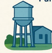
Water & Sanitation