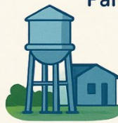
Water & Sanitation