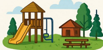
Parks & Rec