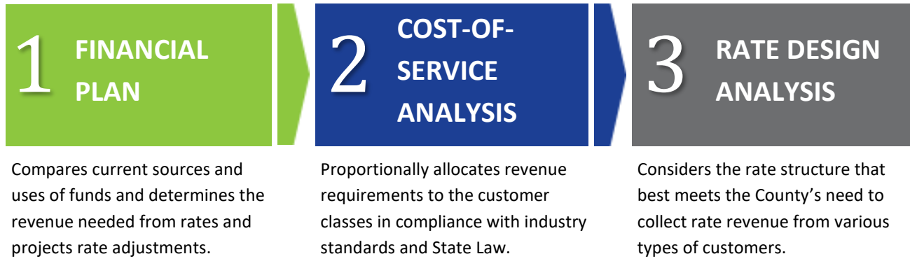
Figure 1. Primary Components of a Rate Study

NBS projected revenues and expenditures, developed net revenue requirements, performed cost-of-service rate analyses, and developed new sewer rates for the County using this approach. The following sections in this report present an overview of the methodologies, assumptions, and data used along with the financial plans and rates developed. Detailed tables and figures documenting the development of the proposed rates are provided in the Appendices.